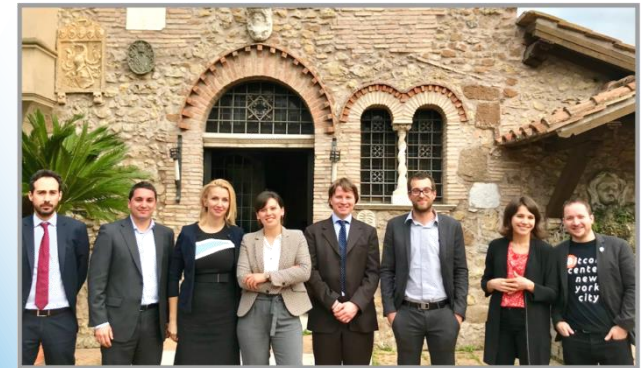
5th Eurelectric meeting was held in Rome at Enel's site, Villa Lazzaroni